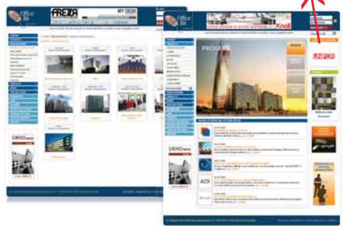
Logo on the Home Page