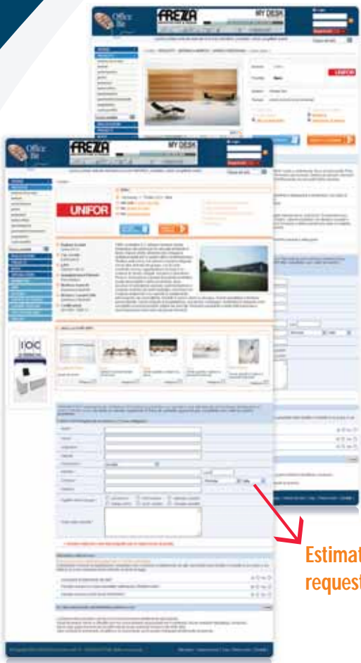
Estimate request form